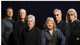
Exhibit Hall Upcoming Events

February 4 th , 2017 Three Dog Night (SOLD OUT)